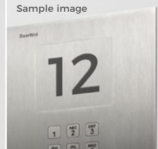
Engravable stainless steel panel included in delivery.